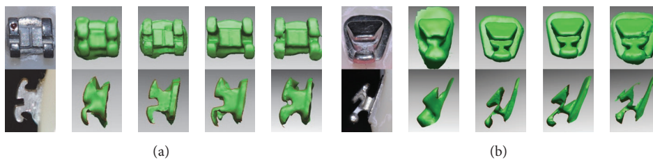
FIGURE 3: Comparison of images of buccal and lingual brackets. From left to right: real image, E4D Dentist, iTero, Trios, and Zfx IntraScan. (a) Buccal bracket on the right maxillary central incisor. (b) Lingual bracket on the right maxillary central incisor.