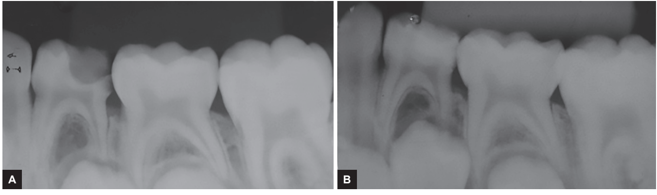
Figs 1A and B: PCR on tooth #74. (A) Initial X-ray; (B) postoperative radiograph in the follow-up period

group II, one tooth showed furcal lesion (5.2%) and other tooth exhibited advanced rhizolysis stage (5.2%). The data of the radiographic assessments are described in Table 1. The comparison of the radiographic outcomes did not show statistically significant differences for any of the study criteria (p > 0.05).