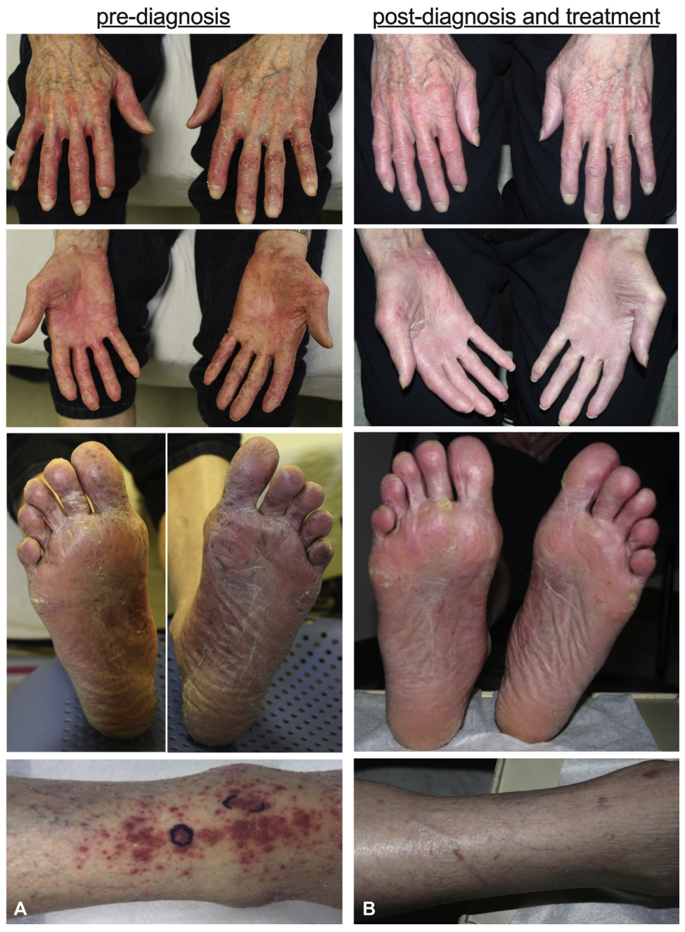
Fig 1. Mycosis fungoides palmaris et plantaris with peripheral blood involvement. Clinical images of hands, ankle, and soles ( A ) before diagnosis and treatment, and ( B ) 5 months after treatment with extracorporeal photophoresis, bexarotene, and spot electron-beam therapy to the palms.

CD8<sup>+</sup>CD3<sup>-</sup>CD5<sup>var</sup>CD7<sup>dim</sup>CD25<sup>-</sup>CD26<sup>var</sup>CD2<sup>+</sup>CD10<sup>-</sup>CD30<sup>-</sup>CD57<sup>-</sup>. Fluorescence in situ hybridization<sup>4</sup> results of peripheral blood mononuclear cells indicated normal copy number for ATM , TP53 , RB1 , CDKN2A , MYC , ARID1A , ZEB1 , STAT3 , and DNMT3A , suggesting that single-nucleotide mutations were likely driving this patient's clonal expansion. High-throughput sequencing of the TCRβ gene