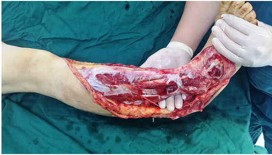
Fig. 7 Case 2. The skin was avulsed from below the left knee to the middle part of the foot including the medial and lateral malleolus. Circumferential multiplane degloving took place, with a large amount of muscle and fat fascia damage