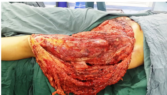
Fig. 1 Case 1. The avulsion of the skin was from the lower left abdomen to the knee joint, and covers an area of about 2200 cm 2 . Circumferential multi-plane injury was observed, accompanied by large amount of muscle and fatty fascia damage

A 28-year-old female was injured by forklift crush that caused skin degloving in the lower left abdomen, as well as the entire thigh and the knee joint. The total damaged area was about 2200 cm 2 . The wound was contaminated and accompanied by circumferential multi-plane injury. The patient was also suffering traumatic and hemorrhagic shock (Fig. 1), with the blood pressure: 76/39 mmgh, p:112 beats/min, HGB:62 g/L, albumin: 23.5 g/L, total protein: 46 g/L, HCT:24.3%, PT:15.3 s. Emergent operation was performed. After wound debridement and hemostasis, the scale of the skin ischemia was decided by puncturing and trimming the skin edge: the fringe of the ischemia lies where there's no bleeding (Ziv et al. 1990). Skin flap lack of blood supply was excised. The remaining skin was pulled together by suture to reduce