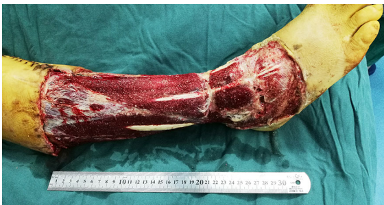
Fig. 8 Case 2. Sixteen days after the injury, and after twice debridement and application of VSD (the first time, during the emergency operation on the day of the injury; the second time, 10 days after the injury) the granulation tissue grew well, with a small amount of tendon was exposed

the edge of the skin pruned and the entire grafted area covered with VSD. The remaining unused part of the skin graft was fixed with 4% polyformaldehyde, for pathological examination.