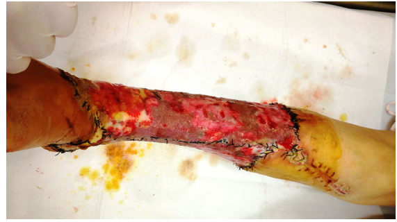
Fig. 9 Case 2. Ten days after autologous skin grafting, the VSD was removed. Most of the skin survived, with necrosis on a small scale (the yellow area). (Color figure online)

Since one large skin grafts instead of several small skin grafts was preserved and then grafted, there was less scar and the final appearance of the operated area looked remarkably better than it was with case 1. The wound was kept dry and the regular change of dressing was maintained until the wound completely healed 28 days after the third operation. Pathology performed on the remaining skin graft showed that the cells and