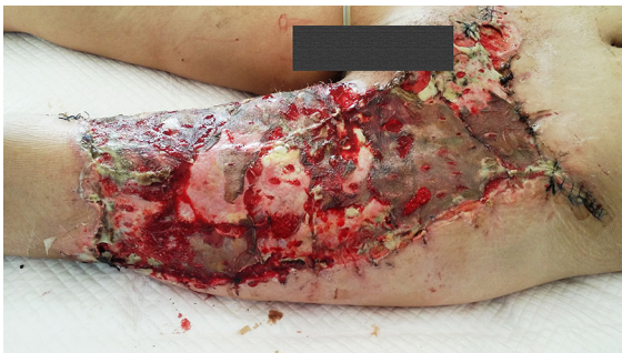
Fig. 3 Case 1. Nine days after the autologous skin graft, most grafted skin survived, with necrosis happening only on a very small scale (yellow parts). (Color figure online)

Ten days after the injury, we found that the granulation in the wounded area had been growing relatively slowly and that there were a small amount of residual necrotic tissues. Debridement was carried out, as well as a change of the VSD coverage.