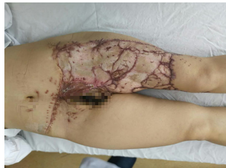
Fig. 5 Case 1. One year later, the skin color changed from flushing to normal color