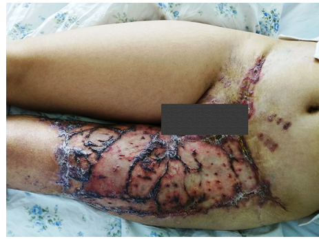
Fig. 4 Case 1. 40 days after skin grafting, the wound was healed, and the skin survived well without infection and vesicles