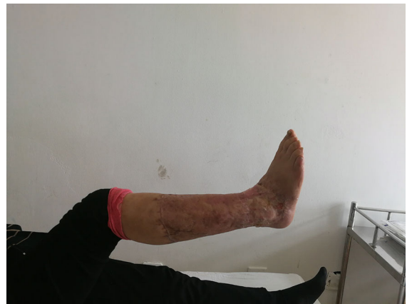
Fig. 10 Case 2. After 1 years of follow-up, the skin texture and the function was acceptable

the tissue structure were complete, but the size of the nucleus increased slightly (Fig. 11).