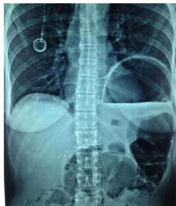
Figure 1 Preoperative plain abdominal X ray showing left hemidiaphragm lifting and gastric overdistension.

A delayed diaphragmatic hernia is an exceptional complication in a patient with AOC who has undergone extensive upper abdominal surgical procedures for maximal