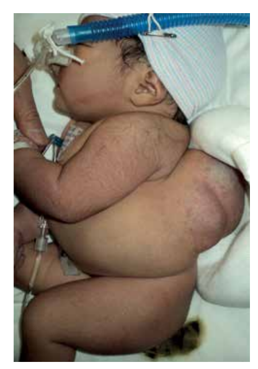
FIGURE 1: Patient at birth with a thoracolumbar rapidly involuting congenital hemangioma characterized by a raised greyish tumor surrounded by a pale halo with multiple tiny telangiectasias

T6 and T11-T12, L1 hemivertebra, and thoracolumbar scoliosis were detected (Figure 2). Altogether, these findings were compatible with a diagnosis of SCD. A MRI revealed cerebellar displacement with tonsillar herniation of 12mm below the foramen magnum consistent with Arnold-Chiari type II malformation, and a thoracolumbar meningomyelocele from T6 to L3 with septate cystic lesions (Figure 3). Cardiac and abdominal ultrasonography, as well as ophthalmological examination and G-banded karyotype (> 550 bands) were normal. The patient died four days later due to respiratory failure. The parents did not agree to a skin biopsy nor an autopsy.