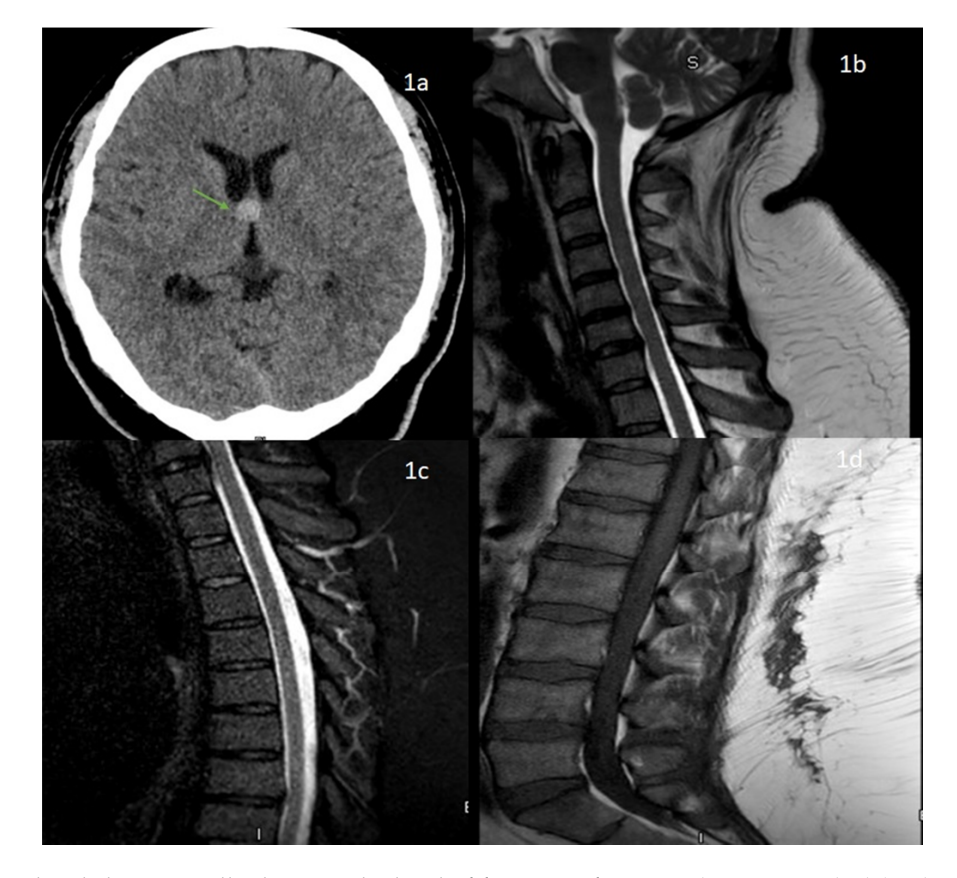
Figure 1. (1a) CT head showing colloid cyst at the level of foramen of monroe (green arrow). (1b,1c) MRI cervical and thoracic spine sagittal images showing no abnormal intramedullary cord signal changes. MRI lumbar spine (1d), T1 weighted sagittal image showing no degenerative disc disease.

Patient followed in outpatient clinic had MRI imaging of brain showed incidental finding of colloid cyst, no facial nerve enhancement, no mass lesion, no abnormal leptomeningeal (Figure 2). Repeat MRI lumbar spine with contrast showed thickening of cauda equina nerve roots suggestive of inflammatory demyelinating neuropathy.