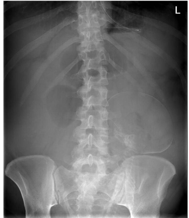
Fig. 2. Plain abdominal radiographic image showing a distended transverse colon.

discontinued. Our patient passed away at 36 years of age.