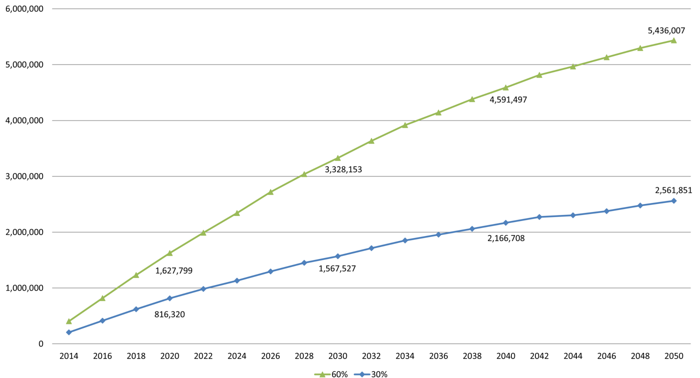
Figure 2 Number of averted diabetes cases, no-intervention scenario versus 30% and 60% diabetes incidence reduction, FEM-Mexico. FEM, Future Elderly Model.