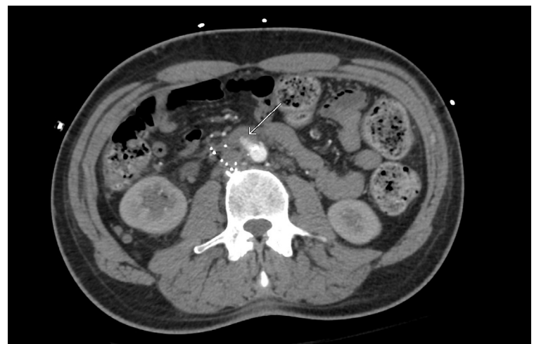
Figure 3. CT angiogram, axial view, showing an aortic pseudoaneurysm projecting into the wall of the third portion of the duodenum.