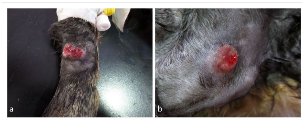
Figure 1 Ulcerated cutaneous skin nodules on the (a) left forelimb and (b) left scapula, month 0

The cat was also enrolled into an epidemiology study, 3 thus surplus EDTA-blood and plasma available were submitted for testing for the presence of infectious, including vector-borne, organisms. The cat was PCR positive for Hepatozoon species using conventional PCR, as well as positive for Leishmania species and CMhm using quantitative PCR (qPCR). Subsequent sequencing identified H felis and L infantum . 3 Owing to the small size