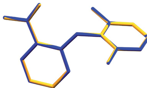
Fig. 1 Superposition of the molecules in the asymmetric unit of Form II 1 (blue) and Form I re-refined (yellow). All non-hydrogenated atoms were used for the overlay (RMS = 0.00966).

a This investigation; performed from the original data of Form I reported by Kovala-Demertzi et al. 2