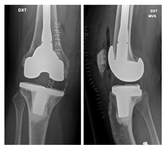
Figure 4. After liner exchange.

posterior build-up of 3° to diminish the excessive slope of the tibial plateau and component.