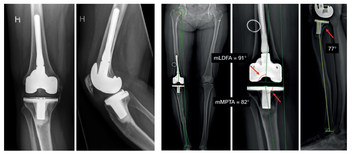
Figure 1. Before liner exchange.

Since only the tibial component was malpositioned and the soft-tissue envelope was intact, we therefore decided to correct the malalignment with a custom-made asymmetric polyethylene liner that was designed in cooperation with the manufacturer (Figure 3). The design incorporated a medial build-up of 6 millimeters to correct the 9^{\circ} of varus and a slight