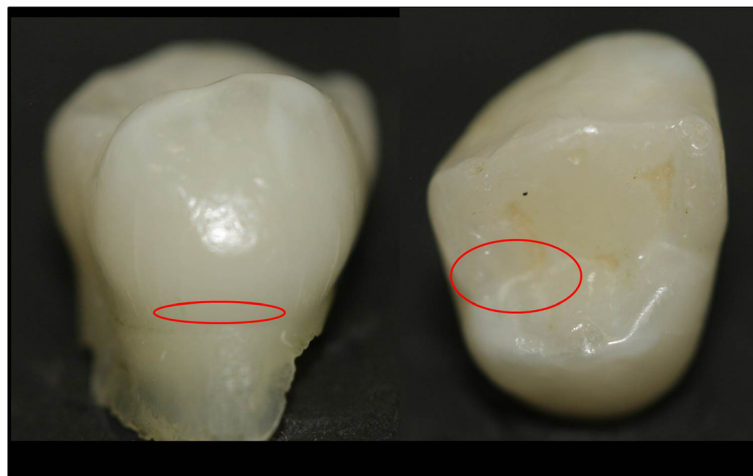
Fig. 1 Schematic representation of area selected for ESEM capture

The ultrastructural damage was set as the outcome for this study. Images of the specimens were captured using an ESEM (ESEM 2020 Electroscan, Philips, Eindhoven, The Netherlands) at \times 140 – \times 150 magnification to ensure