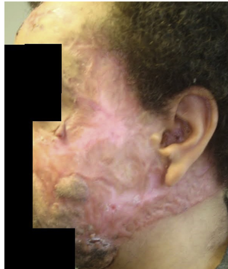
Fig 3. Pyoderma gangrenosum. Resolution of lesions after 6 months of monotherapy with 600 mg intravenous rituximab per week.

With this failed combination therapy adding to the list of exhausted treatment options, the decision was made to attempt a trial of rituximab. Therapy was initiated at a time when all other medications had been stopped. The patient was tapered off systemic steroids successfully over 1 year. The patient noted significant improvement within 3 months of rituximab initiation and complete clearing of the disease at 6 months using monotherapy of 600 mg