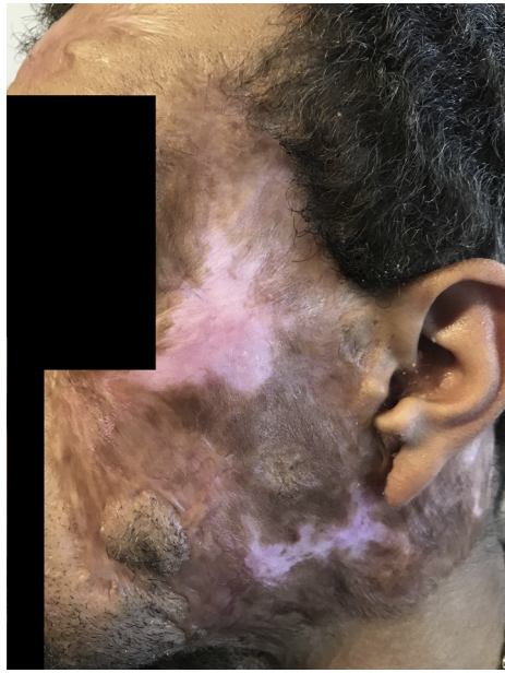
Fig 4. Pyoderma gangrenosum (left profile). Complete resolution of lesions after 10 months of monotherapy with 600 mg intravenous rituximab per week.

Treatment typically targets a variety of immunologic mediators through immunosuppressants and various biologic agents. More commonly used biologics are anti-tumor necrosis factor drugs such as etanercept, adalimumab, certolizumab, and infliximab. 1,2 In cases of recalcitrant PG, treatment can be especially challenging. Patients with recalcitrant PG often resort to experimental or invasive therapies such as unconventional biologics, radiation, and hyperbaric oxygen, 1,6,7 as their condition may not be responsive to systemic steroids, 8 as in our case. The use of apremilast for adjunctive treatment of recalcitrant PG has also been reported. 9