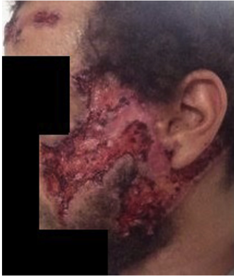
Fig 1. Pyoderma gangrenosum. Extensive ulceration of the face with some involvement of the earlobe upon presentation to our clinic, despite being on 100 mg of prednisone daily for the past 6 years.