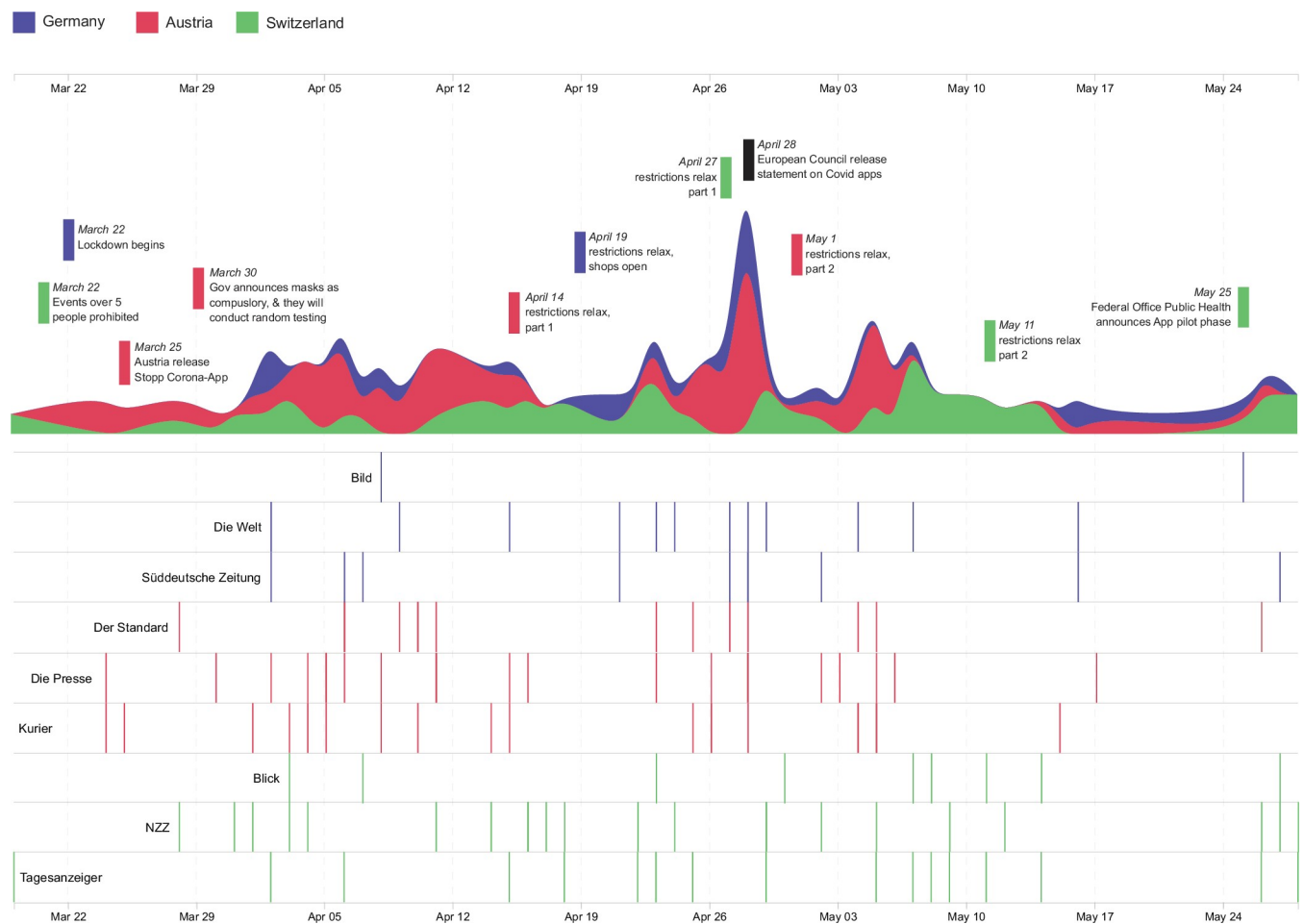
Fig 1. Distribution of analyzed articles published between March 19 and May 29, 2020. Colors represent regions represented. Important events are also plotted.

In the search period (Jan-May 2020), we identified a total of 148 articles that focused on digital contact tracing (S1 Table). These were published between March 19 and May 29, 2020 and came from nine newspaper companies. The majority of articles (69 articles, 46.6%) were Austrian, from the newspaper companies: Der Standard (17 articles), Die Presse (30 articles), and Kurier (22 articles). Germany had 26 articles (17.6%) from Bild (2 articles), Die Welt (13 articles), and the Süddeutsche Zeitung (11 articles). From Switzerland were 53 articles (35.6% articles) from Blick (12 articles), Neue Zürcher Zeitung (23 articles), and Tages Anzeiger (18 articles). Fig 1 shows the distribution of articles over time alongside key events in each region