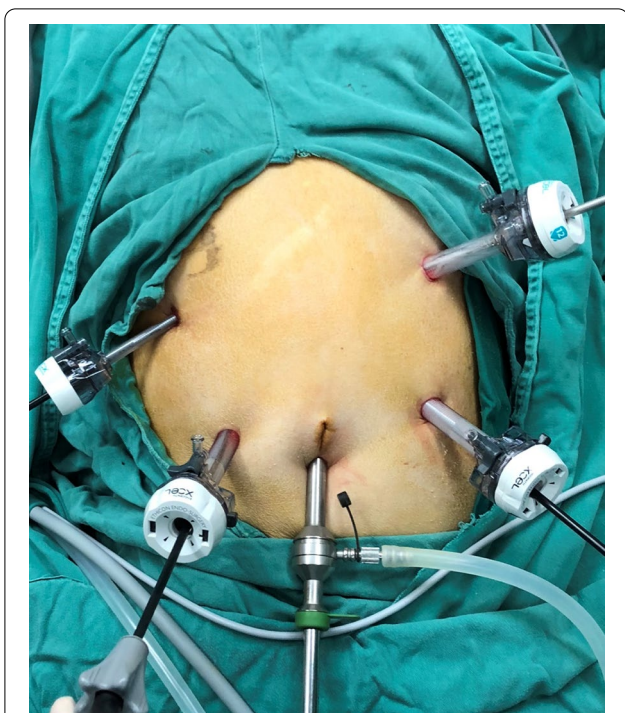
Fig. 1 The routine distribution of five trocars