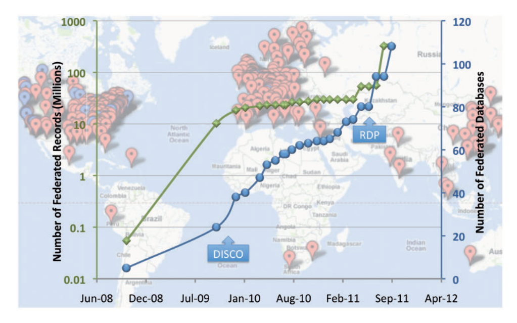
Figure 1. NIF Resource Landscape. Background: each point on the map represents a global location that houses one or more resources registered with the NIF (via NeuroLex). Red points represent NIF registry entries and blue points represent databases and data sets incorporated into the data federation. Foreground: the blue line represents a plot of the number of federated data sources over time, and the green line represents the number of records in the NIF Data Federation over the same time (note these records come from only the blue dots and that the scale is logarithmic). The DISCO protocols and automated resource crawling were integrated into NIF system function in November 2009 and led to a growth of NIF holdings and in mid 2011, significant enhancements of the DISCO protocols allowing for enhanced automation of data ingestion, as well as the current resource discovery pipeline (RDP) were implemented.