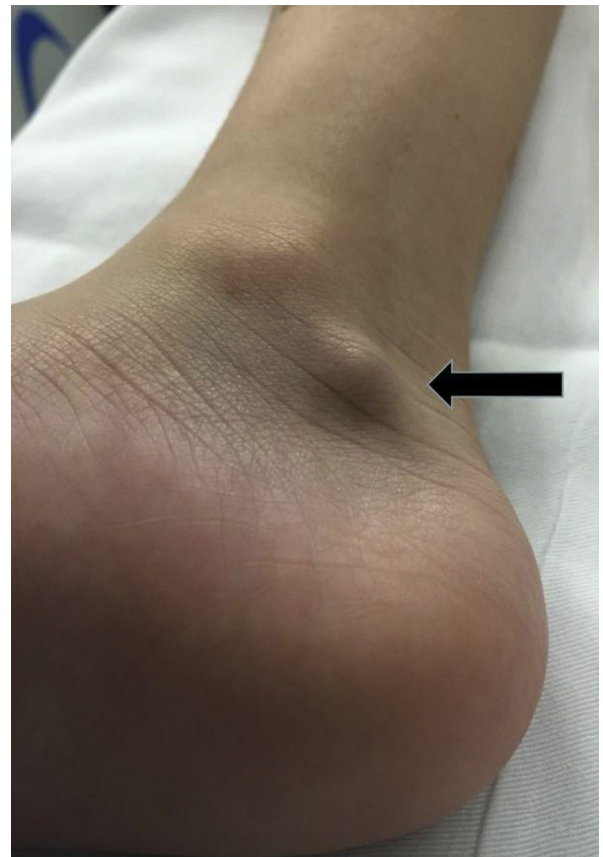
Fig 1. A pulsatile mass (arrow) caused by a posterior tibial artery aneurysm is seen adjacent to the medial malleolus in this child.

Comprehensive genetic testing was performed for transforming growth factor- \beta (TGF- \beta ) receptor 1 ( TGFBR1 ) and receptor 2 ( TGFBR2 ) mutations (mutation causing Loey-Dietz syndrome), collagen type III alpha 1 ( COL3A1 ) mutation (mutation causing Ehlers-Danlos syndrome type IV), and SMAD3 mutations. These genetic evaluations revealed a disease-causing mutation in SMAD3 .