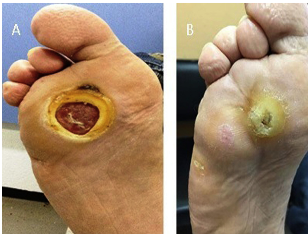
Fig. 2. A 49-year-old male with a diabetic plantar ulceration of the right foot. (A) The initial ulceration observed on the left foot (A) was Wagner grade 2. (B) After treatment with topical chitosan for 90 days, almost complete closure of the lesion was observed without evidence of infection.

this toxicity interferes with the tissue repair process by increasing inflammation (Burkatovskaya et al., 2008).