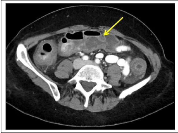
Figure 1. Diffuse colitis seen on computed tomography image (arrow).

treatment, revealing one site positive for invasive squamous cell carcinoma. Magnetic resonance imaging of the abdomen and pelvis did not show any definitive anal mass. Positron emission tomography/computed tomography showed abnormal uptake in the anorectal region. Human immunodeficiency virus serology was nonreactive.