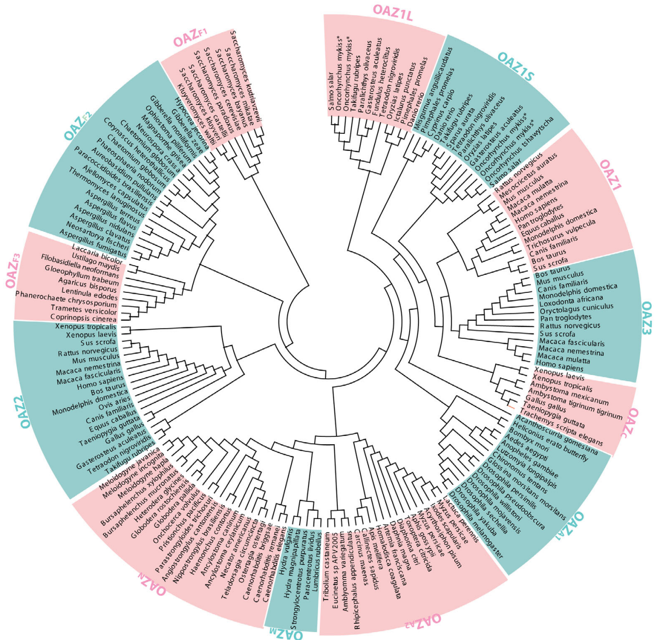
Figure 2 Scheme of analyses performed by OAF. OAF pipeline. Each step performed by OAF is shown as a box, grey boxes represent external modules utilized by OAF.

increase OAF speed by reducing the number of candidate sequences for subsequent HMM analysis. Relaxed parameters decrease the chances of losing true positives in this process. The scheme of analyses performed by OAF is illustrated in Figure 2.