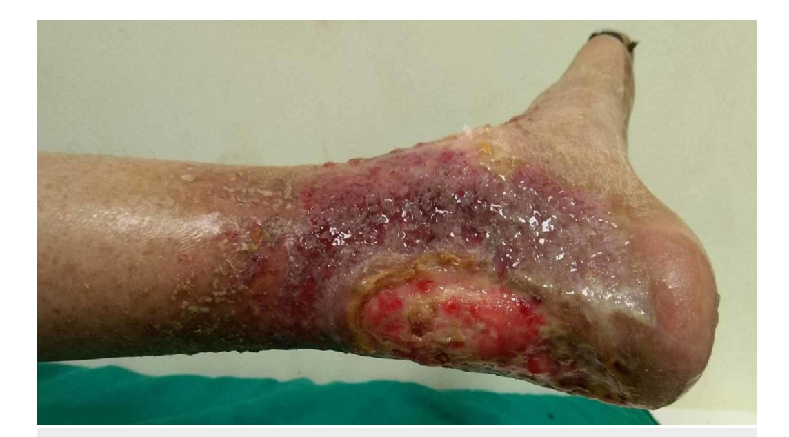
FIGURE 3: Well-defined ulcer with pale granulation tissue and hyperkeratotic margins, with the surrounding skin covered with serosanguinous discharge

Ocular examination showed pseudophakia in both eyes, and slit-lamp examination showed multiple tessellations on the fundus. Routine investigations of the patient were within the normal limits. Hormone levels were within the normal limits except for elevated thyroid-stimulating hormone levels (26 mIU/L) and decreased total serum testosterone (135 ng/mL). Biopsy of the ulcer was performed, which showed no evidence of dysplasia/malignancy. Radiographic examination of hands and feet did not show any signs of osteosclerosis. Carotid Doppler showed early atheromatous changes in the right distal common carotid artery. Semen analysis performed in view of infertility showed decreased semen volume per ejaculate as well as decreased total sperm count. Laryngoscopy revealed fibrosis of the cricoarytenoid and sulcus vocalis (Figure 4 ).