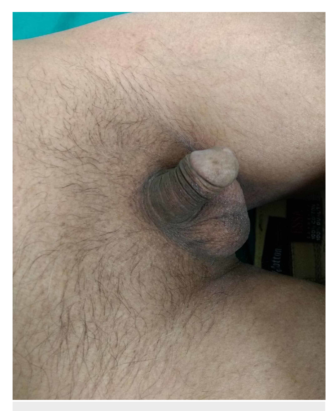
FIGURE 2: Sparse pubic hair with hypogonadism

Physical examination also revealed underdevelopment of secondary sexual characters with sparse facial, axillary, and pubic hair, and infantile genitalia with micropenis and decreased testicular volume (Figure 2).