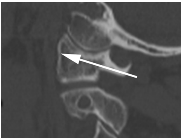
Fig. 3 Technique for inserting the simulated screw ( arrows ) in sagittal view

and the other in the foramen transversarium, both points were chosen narrowest to the screw. Then the distance between the two points and the screw was calculated.