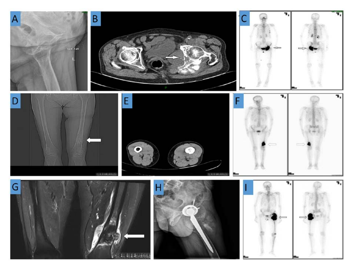
Figure 1. Case 1: (A) X-ray revealed bony changes in the upper left suprapubic branch, ischium and acetabulum; (B) CT demonstrated irregular bone destruction of the left acetabulum and ischium and adjacent soft tissue swelling; (C) A whole body bone scan revealed increased bone metabolism in the left acetabulum, ischium, femoral head, left fourth and fifth ribs and T8 vertebra. Case 2: CT demonstrates a soft tissue mass shadow and a bony mass shadow attached to the surface of the bone at the distal end of the left femur. (D) Coronal view. (E) Transverse view. (F) Increased bone metabolism at the distal end of the left femur. (G) MRI of the distal femur shows irregular bone destruction with an abnormal signal shadow. Case 3: (H) X-ray shows that after left artificial hip joint replacement, a soft tissue mass shadow is visible in the upper left femur; (I) A whole body bone scan revealed increased bone metabolism in the left upper femur.

original femoral prosthesis was removed, and upper femoral bone destruction was visualized. In the surgical field of view, the tumor appeared similar to the flesh of a fish and invaded the surrounding soft tissue, with ill-defined margins. Moreover, intraoperative cryosectioning revealed malignant tumor cells. Subsequently, granulation tissue within the medullary cavity, the surrounding tumor tissue, and the surrounding affected muscle tissue were completely removed. Subsequently, a customized tumor prosthesis was implanted into the medullary canal and fixed with bone cement. As the original acetabular cup was tilted backward, polyethylene was added to the trailing edge to prevent dislocation. Following resetting of the cup, the hip joint was examined for completeness and satisfactory mobility. Finally, the wound was soaked in distilled water, and was repeatedly washed with hydrogen peroxide and physiological saline. A drainage tube was placed under the muscle layer, the fascia was sutured, and the incision was closed layer by layer.