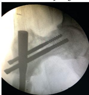
Figure 4: Intraoperative C arm image showing the proximal fixation with fracture reduction.

Paget's disease of bone (commonly known as Paget's disease or historically, osteitis deformans) is a condition involving cellular remodelling and deformity of one or more bones. The affected bones show signs of dysregulated bone remodelling at the microscopic level, specifically excessive bone breakdown and