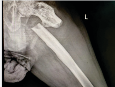
Figure 2: X-ray of the left hip with femur lateral view showing subtrochanteric fracture.