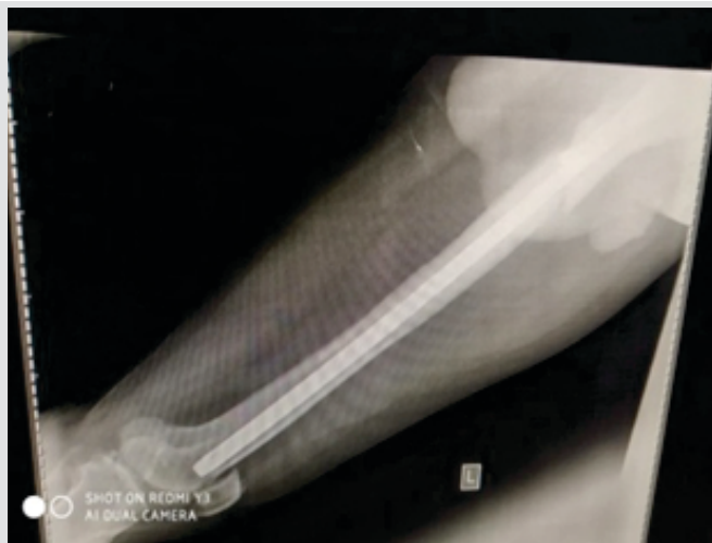
Figure 8: Follow-up X-ray at 1 year lateral view.

subsequent disorganized new bone formation [4]. These structural changes cause the bone to weaken, which may result in deformity, pain, fracture, or arthritis of associated joints. There is a high rate of bone remodelling at affected sites in the skeleton, and the bone is highly metabolically active and has a high blood flow, which can make the overlying skin feel warm to the touch [5].