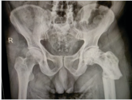
Figure 1: PBH X-ray showing left subtrochanteric fracture with diffuse irregular cortical and trabecular bone thickening of the left femur.