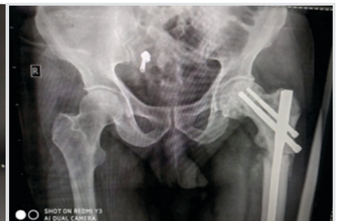
Figure 7: Follow-up X-ray at 1 year AP view.