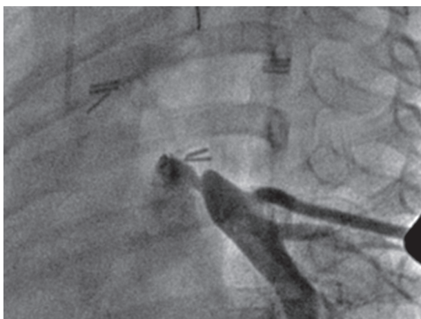
Figure 1. Intraoperative angiography: stenosis of left pulmonary artery (LPA) in the area of anastomosis with xenograft conduit; the patient is a 6-year-old boy after anatomic correction of pulmonary atresia with ventricular septal defect (PA-VSD)