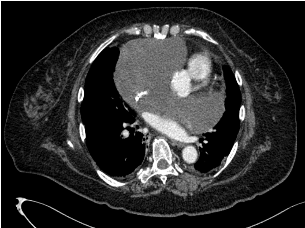
Figure 2: Contrast-enhanced chest computed tomography scan confirmed the ultrasound findings and showed mass effect on the superior vena cava, which was significantly narrowed. The inside of the tumor could not be clearly visualized on contrast-enhanced imaging; neither fatty nor calcified components were observed.

admission. Post-mortem pathological examination was performed with the consent of her family; a mediastinal tumor containing a large amount of nonserous fluid that invaded the heart and large blood vessels was macroscopically found. Microscopic examination of hematoxylin and eosin-stained slides of the tumor specimen showed no pattern or any specific tissue architecture at low magnification (Figure 3A), indicating an undifferentiated malignant tumor. In addition, highly deformed nuclei were found on high magnification (Figure 3B). Immunostaining showed positive results for vimentin (Figure 3C) and negative results for CD5, CD31, CD34, CD45, CD68, CD138, CK-CAM5.2, CK-AE1/1, AE3, EMA, calretinin, desmin, \alpha -SMA, MA-HHF, S100, D2-40, HMB45, EMA, and MelanA. Thus, the condition was diagnosed as undifferentiated pleomorphic sarcoma.