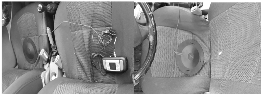
Fig. 1 Measurement of whole body vibration among the study population

Here, a_v is the vector sum of the RMS frequency-weighted accelerations while a_x , a_y and a_z represent the RMS frequency-weighted accelerations in the specific direction. The daily 8-hour frequency weighted exposure to vibration acceleration is determined using Eq. 3.