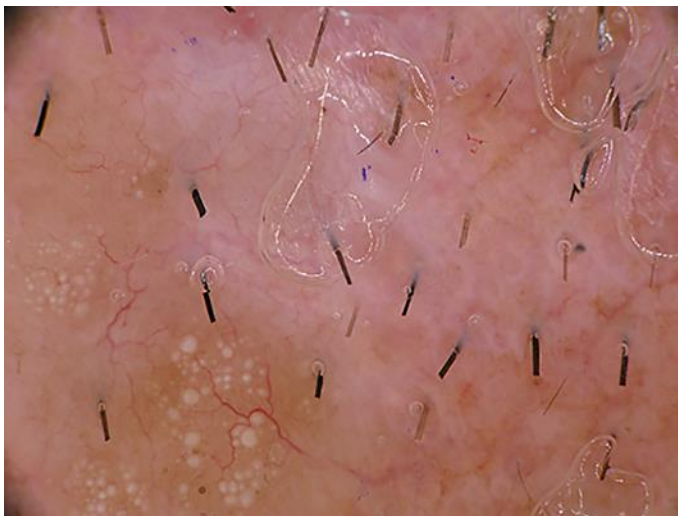
Fig. 2. Dermoscopic picture showing an ivory white background, multiple grouped keratin cysts, and arborizing telangiectasias of different caliber.