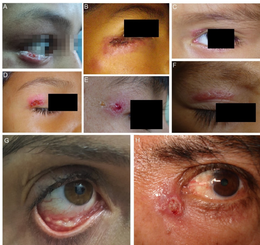
Figure 3. Clinical types of lesions observed in patients with ocular sporotrichosis. (A,B) Lymphocutaneous eyelid sporotrichosis is characterized by the emergence of an indurated papule and nodules contiguous to the initial lesion. (C–E) Fixed sporotrichosis in upper eyelid. (F) Fixed sporotrichosis; granuloma-like plaque in upper eyelid. (G) Granulomas in the lower right palpebral conjunctiva. (H) Dacryocystitis in the left eye.