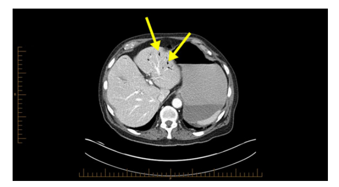
Figure 2: Computerized tomography abdominal axial section showing air within the hepatic portal veins (yellow arrows).

With a rising C-reactive protein of 560 mg/l (1-10 mg/l) and his clinical condition, an exploratory laparotomy was performed. Intra-operative findings were moderate bowel oedema, but no bowel or mesenteric necrosis. His abdomen was closed after division of adhesions of the jejunum and ileum. The patient was apprised of the likely diagnosis of chemotherapy/radiotherapyrelated severe enterocolitis with adhesions. Twenty-seven days post-admission and a conservatively managed complication of small bowel obstruction, he was transferred back to the rural hospital to be closer to his family.