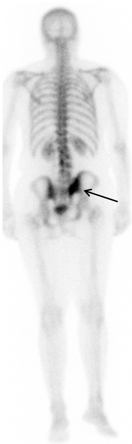
Figure 1 Bone scan posterior view of a 54-year-old woman with a 2-year history of recurrent colon cancer revealed a focal tracer uptake in the right sacroiliac joint area suggesting possible bone metastasis.

other organs. When combined with the temporal difference between the time from liver metastasis to bone metastasis and the time from lung metastasis to bone metastasis, this finding suggests that lung metastasis indicates refractory, potentially serious disease more precisely than liver metastasis does. Most lung and liver metastases that we observed consisted of multiple lesions. However, solitary lesion occurred more often in the liver than that in the lung.