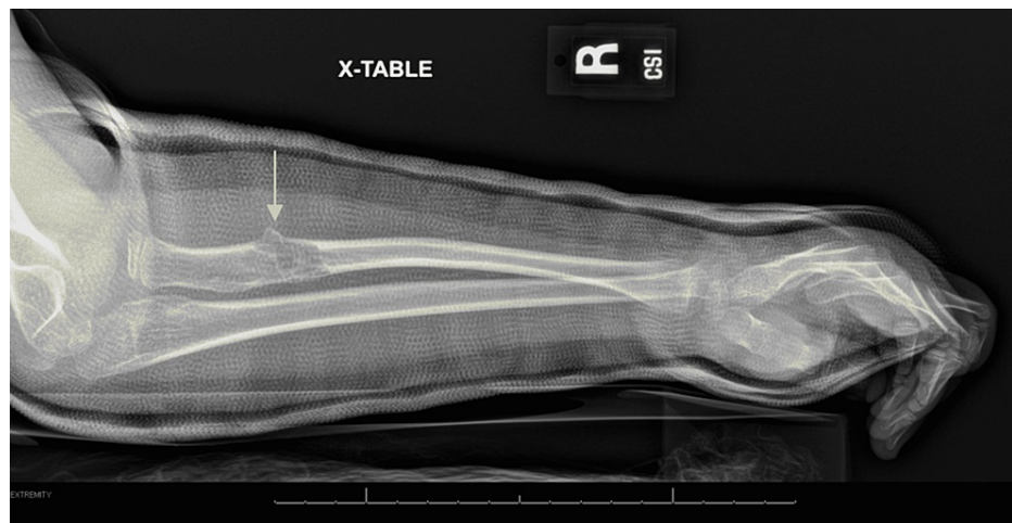
FIGURE 1: Pathologic fracture of the proximal right radial diaphysis with underlying lytic lesions (arrow).

An X-ray skeletal survey was ordered, which revealed multiple lytic lesions in the right humerus, as seen in Figure 1, as well as in the right fourth rib, left sixth rib, calvarium, mandible, left iliac wing, right proximal femur and distal diaphysis, left proximal femur and mid diaphysis, and left proximal tibia metaphysis. Accompanying these bony lesions was a mediastinal mass, obscuring the left heart border but with no significant airway compression or associated pleural effusions.