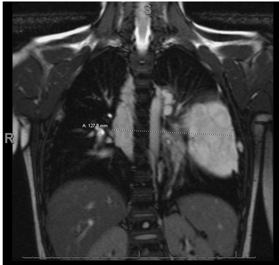
FIGURE 3: MRI demonstrating macrocystic infiltrative multicompartmental mediastinal mass measuring 13 × 12 × 17 cm suggestive of a lymphatic malformation.

Although diagnostic imaging findings strongly suggested the diagnosis of GLA, a definitive diagnosis was obtained via ultrasound-guided percutaneous drainage of the anterior mediastinal mass and CT-guided bone biopsy of a cystic lesion in the pelvic bone. The dominant locule of the cystic mediastinal mass was aspirated with a 5-Fr Yueh needle via ultrasound guidance, yielding approximately 400 mL of serous, non-bloody fluid. The cyst did not reaccumulate fluid post-drainage. Doxycycline sclerotherapy was performed subsequently using 200 mg doxycycline in 10 mL water.