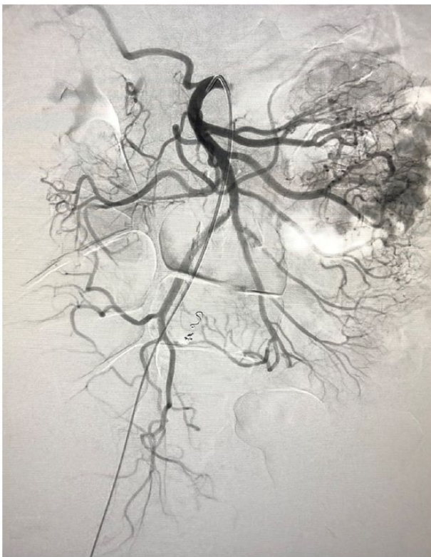
Figure 4. Control arteriography did not identify the arterial blush and the fistula.

The most used embolic agents include polyvinyl alcohol (PVA), Gelfoam, coils, autologous coagulum, and n-butyl cyanoacrylate (NBCA) 13 . Among these agents, we prefer the coils because they are well visualized during direct fluoroscopy and precision in the release of the coils, avoid the reflux of particles, and fulfill the objective of reducing the perfusion pressure while allowing collateral flow to prevent the infarction. We prefer to use controlled release coils to have greater accuracy of occlusion of the bleeding vessel. By using this type of device