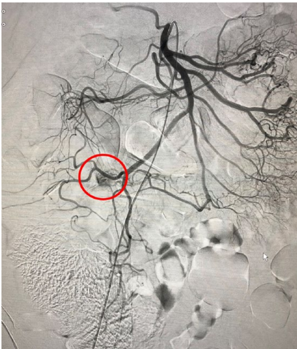
Figure 1. Small blush identified in the arterial phase in terminal branches of the superior mesenteric artery (red circle).

Angiodysplasia is a vascular malformation of the bowel, prevailing in the terminal ileum, right colon and cecum, and pathologically expansive blood capillary between artery and vein.