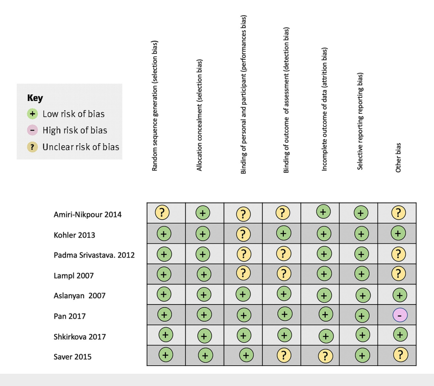
FIGURE 2: Bias of the clinical trials of minocycline and magnesium on ischemic stroke using the Cochrane collaboration's risk of bias tool

The study of Pan et al., where potassium-magnesium-enriched salt was introduced in the diet had a tiny sample. At the same time, the study's power was not good enough [6]. It is also mentioned that there was no pure magnesium group, and the benefits of the study could be due to synergistic effects of potassium and magnesium interaction and not just by the impact of magnesium itself [6]. Figure 2 summarizes the bias found in this study [2-6,10-13].