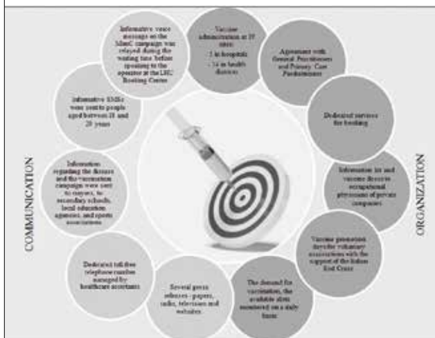
Fig. 2. The LHU of Florence vaccination programme. Organization and communication strategies during the emergency meningococcal C campaign in Tuscany.

As expected, the occurrence of each new meningococcal invasive case generated a rise in vaccination demand. In particular, in February 2016, weekly contacts on workdays were almost 3,000 on an average, reaching peaks of over 4,000 requests per day.