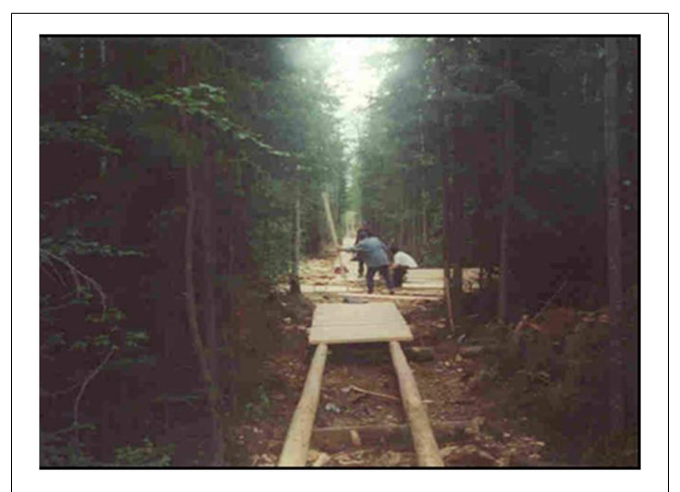
FIGURE 2 | Image showing a boardwalk portion of the walking trail under construction.

the people of Sandy Lake to attend the activities held by choosing activities that would interest a large number of people and by using prizes and other incentives. Throughout the year, community members can sign up for various sports tournaments such as baseball, hockey, and broomball, and can also participate in scavenger hunts, weight loss challenges, fitness classes, cooking classes, and walk to work days. Diabetes prevention program staff do not just promote planned exercise, they encourage people to become more active and less sedentary in their everyday activities.