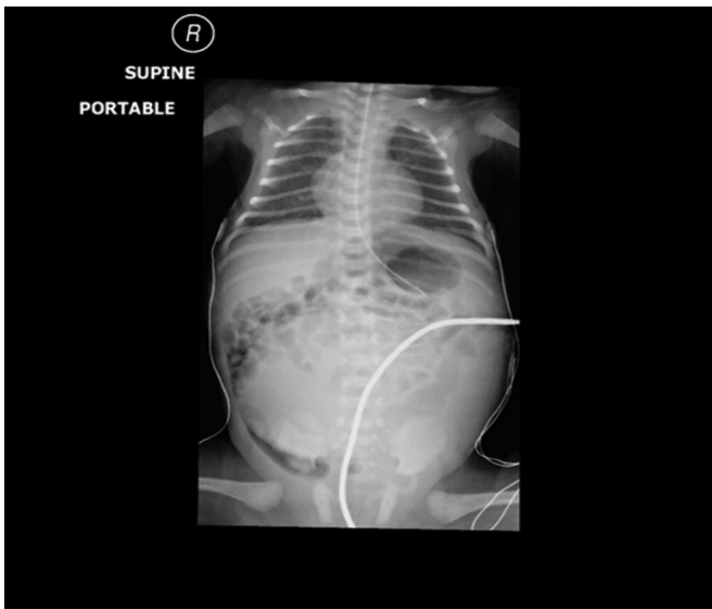
Figure 1. Abdominal X-ray showing fullness in the mid abdomen with laterally displaced ascending colon.

serum CR level declined to 0.4 mg/dL, hyperkalemia and metabolic acidosis resolved and the baby was discharged home at post-operative day 7 in a good general status.