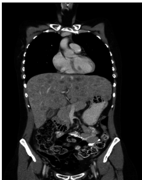
Figure 1. Coronal CT image demonstrating bilobar hepatic lesions, consistent with liver metastases.

The highest incidence of NET is seen in the gastrointestinal tract (i.e., gastroenteropancreatic, 67.5%), followed by the bronchopulmonary system (25.3%), with