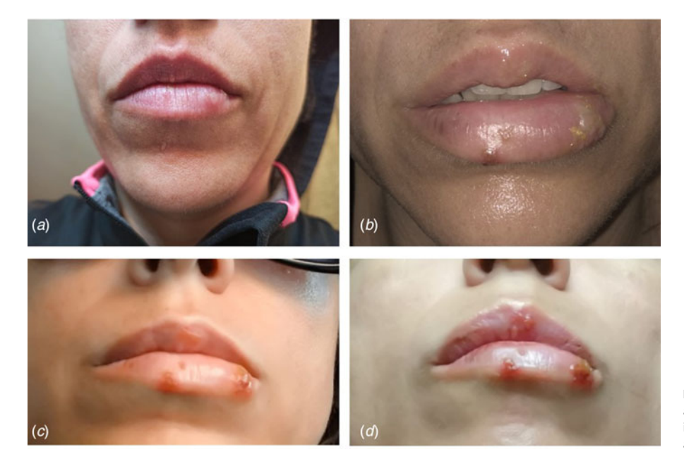
Fig. 2. Case 2. (A) Prodormal period with burning area and itching on the lower lip; (B and C) florid period of infection with increased number of vesicles on the lips and (D) referral period. Negative RT-PCR for SARS-CoV-2.

and decreased cardiac output with multi-organ damage [15, 17]. This altered immune response facilitates the replication of the virus and the increase in the viral load, by means of causing the NK cells and CD8+ lymph T cells to become exhausted and hence the coronavirus cannot be eliminated [18]. In the same way as occurs in other states of hyperactivation of the immune system, such as burn patients, polytraumatised patients and head trauma patients, the increase in adhesion molecules could generate a state of immunodeficiency of T and B lymphocytes which would remain attached to the endothelium of the blood vessels and therefore unable to enter the site where they should perform their function [19, 20]. In addition, the SARS-CoV-2 infection produces a reduction in the percentages of monocytes, eosinophils and basophils [2].