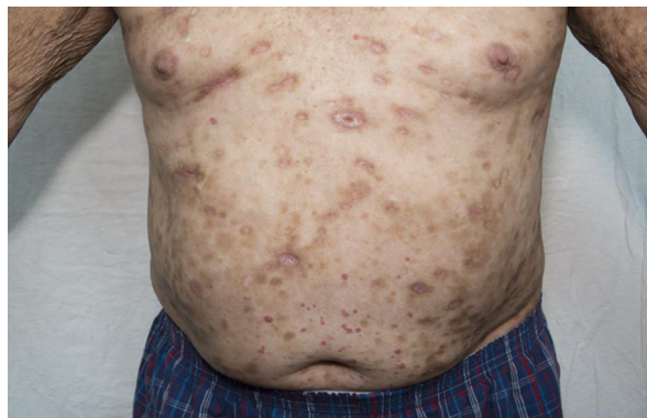
Figure 2 Patient 2 months after total skin electron irradiation.

partially away from the body and fingers spread apart. Three gantry angles of 0°, 60°, and 300° were used to provide optimal dose homogeneity for both the AP and PA positions. Monitor unit (MU) weighting for the gantry angles, which were empirically determined and described previously, 5 were MU 300° equal to MU 60° , and MU 0° equal to 0.41 MU 60° to account for the fact that the MU 0° delivers more dose per MU than the 60° and 300° beams. The left posterior oblique, right posterior oblique, left anterior oblique, and right anterior oblique positions are set up with the patient oriented parallel to the waveguide and the umbilicus at a distance of 230 cm from the isocenter, with a gantry setting of 300°. The polycarbonate spoiler is positioned adjacent to the patient as depicted in Fig 4.