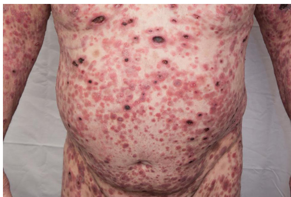
Figure 1 Patient's initial presentation to radiation oncology after 3 different courses of systemic therapy and before total skin electron irradiation.

The patient setup is depicted in Figs 3 and 4. The 6 conventional standing positions 1,4 are reproduced on the floor and described here. For the anteroposterior (AP) and posteroanterior (PA) positions, the patient's umbilicus is positioned either supine or prone directly below the isocenter with the skin surface about 5 cm below the polycarbonate spoiler, and the patient is oriented perpendicular to the LINAC waveguide. The patient lies on a thin mattress (about 3 cm thick) with arms and legs