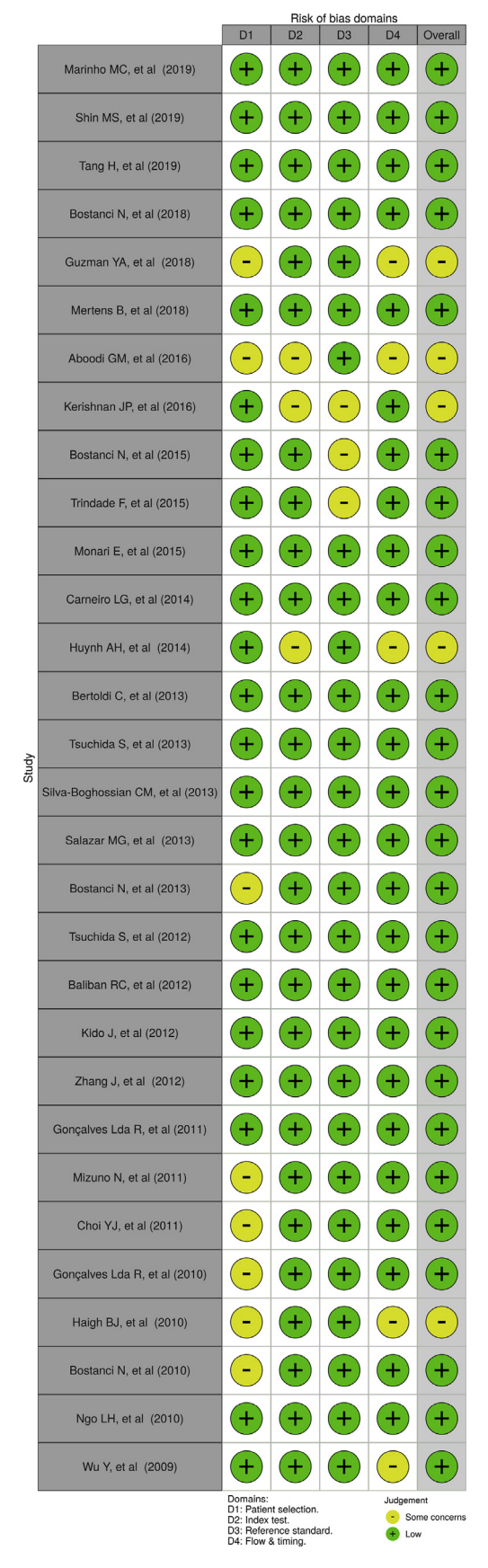
Figure 3. Risk of bias plots of the domain-level judgements for each individual study.

one study that uses systemic disease (Diabetes Mellitus type 2) subjects, and most of the studies utilize the 1999 classification of periodontal diseases for diagnosis. In this review, there were no proteomic studies using the latest classification of periodontal diseases. In the new classification for periodontal diseases, periodontitis was characterized based on staging and grading system [10].