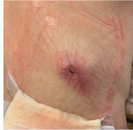
FIGURE 1: Right midback, nonpigmented, raised mass with the central area of erythema and serous drainage.

The patient underwent additional workup for the PET findings. The patient returned to the clinic and reported that her last mammogram was performed over one year ago but was negative for malignancy. She denied breast skin changes, nipple discharge, and noticeable breast masses. Physical exam revealed a round, mobile palpable mass at 1:00 approximately 5 cm from the left nipple-areola complex. While the breast mass appeared benign, a bilateral diagnostic mammogram and left breast ultrasound were ordered to rule out malignancy in light of her current presentation of carcinoma with unknown origin. Mammography confirmed a suspicious mass in the left breast, and pathology from the ultrasound-guided biopsy revealed invasive ductal carcinoma, grade 3 (ER 0%, PR 0%, HER-2 1+, Ki-67 80%). She underwent a left lumpectomy with pathology confirming