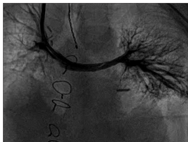
Figure 3: Angiogram after balloon dilation the left pulmonary artery and upper lobe branch three weeks after catheter directed thrombolysis. Note a widely patent central pulmonary artery with limited distal pulmonary tree