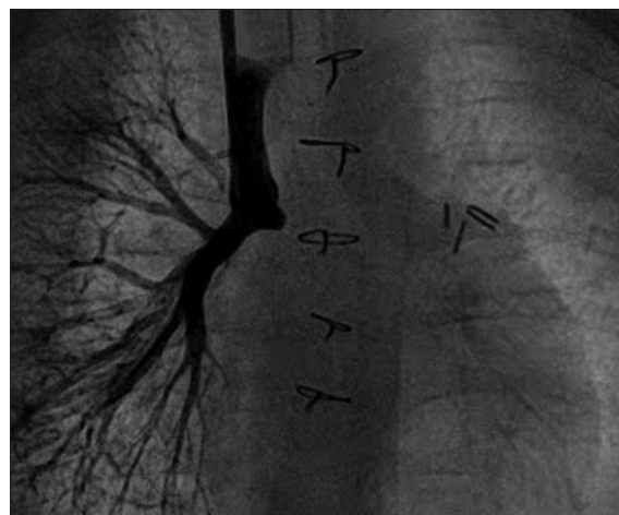
Figure 1: Angiogram in the superior vena cava demonstrating complete re-occlusion of the left pulmonary artery on repeat catheterization

The first successful CDT for acute pulmonary artery embolism was reported in 1996 by Beitzke et al. [7] in a 3-year-old girl who presented with near lethal PE 3 weeks after Fontan operation. Nomura et al. described, in 2014, a case of 20-year-old woman with thromboembolism of