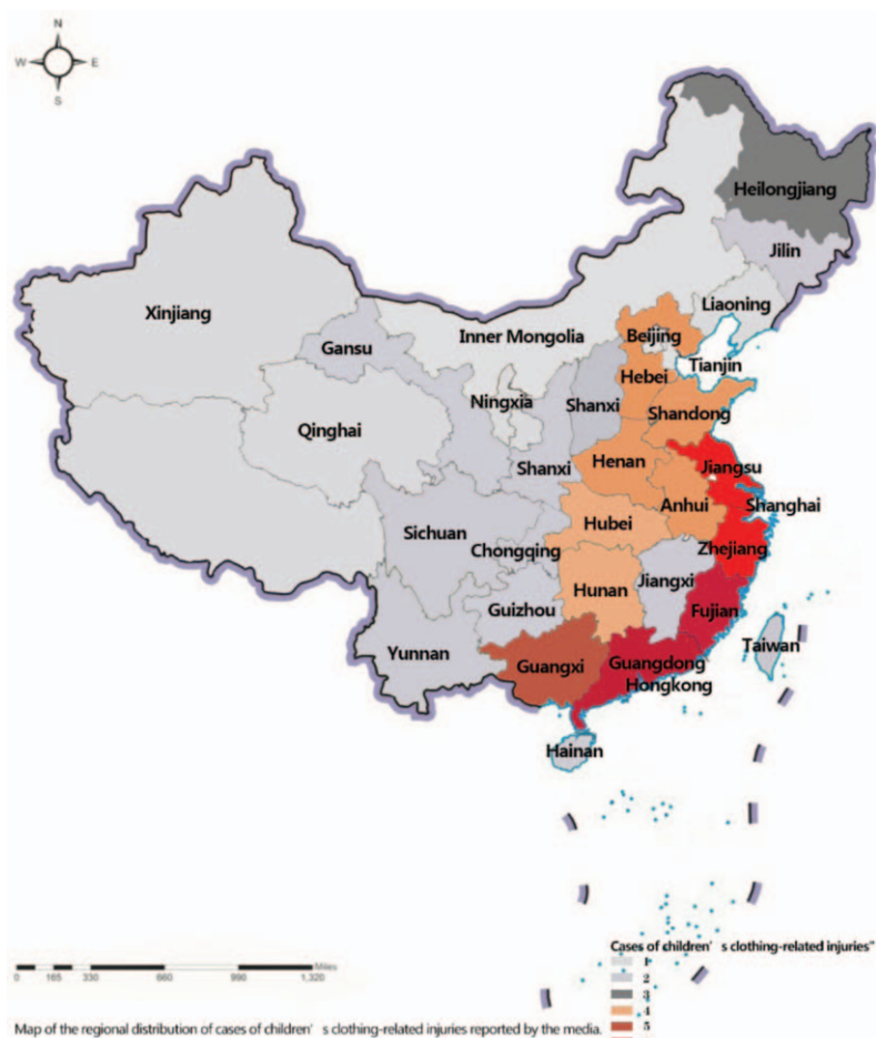
Figure 2. Regional distribution of cases of children’s clothing-related injuries reported by the media.