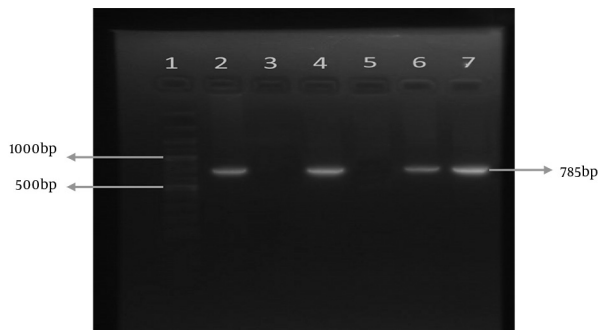
Figure 1. Amplification of sabA Using Primer Pair 1 in Representative Strains of H. pylori .

Lane 1 is the 100 bp marker. Lanes 2 and 3 are positive and negative control strains respectively. Lanes 4 to 7 are representative clinical H. pylori strains.