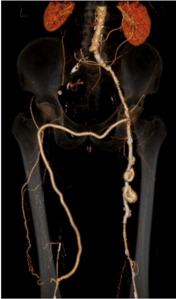
Fig. 2 – Computed Tomography Angiography reconstruction of the left femoral to right popliteal bypass, left iliac artery stent, and left superficial femoral artery pseudoaneurysms

There is scarce literature on aneurysm degeneration following the application of paclitaxel coated devices, with only two case reports published, both used paclitaxel on their devices [1,2]. Golouh et al. presented a case where a SFA PSA developed after the use of paclitaxel. Whilst a second study by Chen et al. described the development of a vein bypass graft PSA post the application of paclitaxel however it is important to note that balloon overinflation may have also contributed to this phenomenon as illustrated by contrast extravasation during initial treatment. Thus, the true etiology of these PSAs is known however, with recent discussions regarding mortality risk associated with paclitaxel endovascular techniques, it is prudent to continue surveillance for patients undergoing subintimal drug coated treatment for lower limb recanalization.