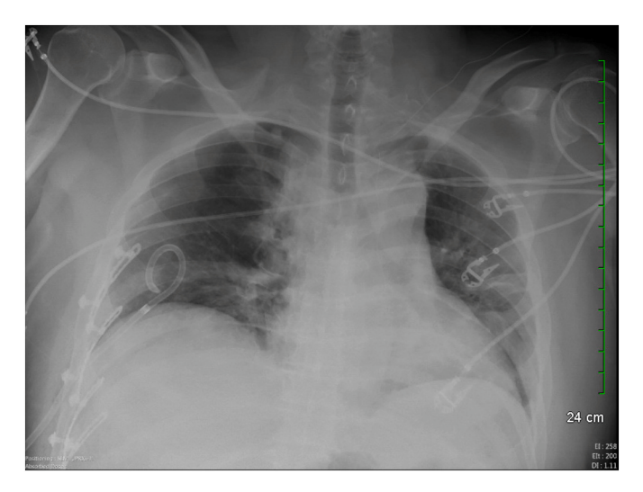
Fig. 3. Chest X-ray showing intrathoracic rib plates on right ribs 6 through 9.

Postoperatively, the patient resumed working with respiratory therapy on an aggressive pulmonary hygiene regimen. He immediately expressed his satisfaction that he could no longer feel his ribs "clicking" on inhalation and that he was pleased with his decision to undergo fixation. On post-operative day (POD) 1, he was out of bed and ambulating the halls, something he had not desired much since admission. His incentive spirometry measurements and oxygenation requirements began to improve, and they improved each