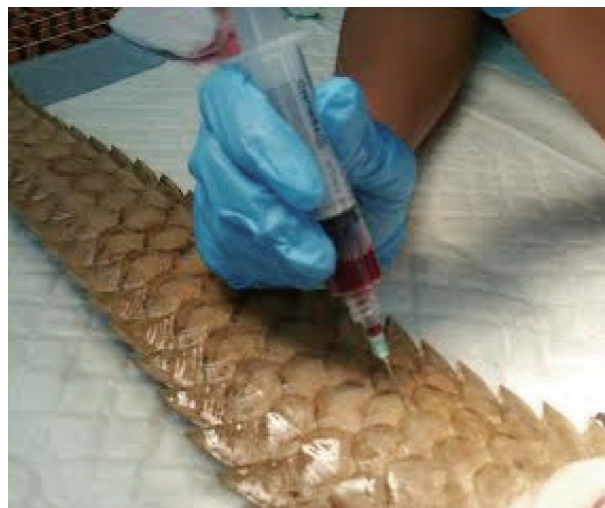
Fig. 1. Blood collection from the coccygeal vein on the ventral aspect of the tail of a Sunda pangolin under general anesthesia.

The reference intervals of this study were compared to the results of a previous study on confiscated Sunda pangolins [36]